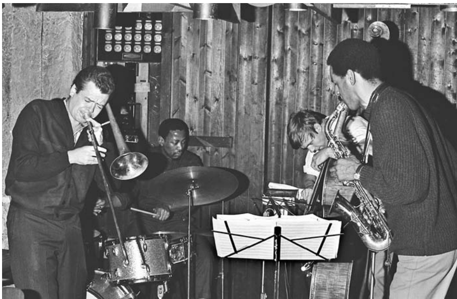
New York Art Quartet.

Who remembers 1965? If you don't: The Beatles, Rolling Stones, Byrds, Beach Boys, and Motown held sway on the pop charts, John Coltrane shook up the jazz world, Sinatra was still Chairman, Dino (Martin) was cool, and—as usual—some note-